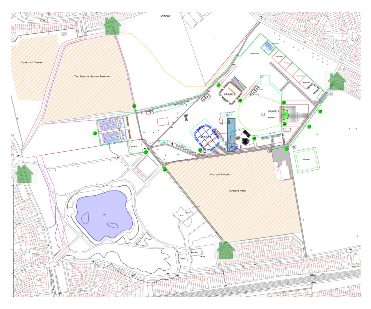
Figure 8.1 – Sound Site Proposals with closest critical receptor positions

The following assumptions have been made in predicting noise levels.